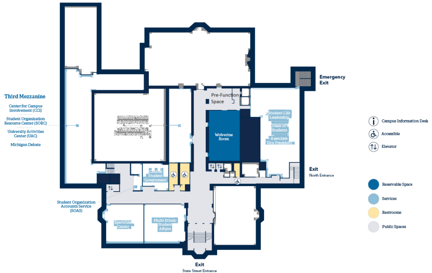
Michigan Union Third Floor